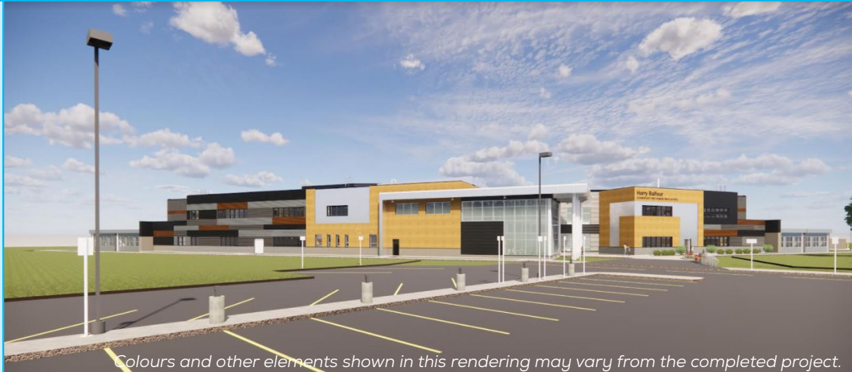
Colours and other elements shown in this rendering may vary from the completed project.